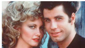
'Grease' singalong to debut at the Hollywood Bowl