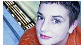
Sinead O'Connor speaks out about pope, abuse