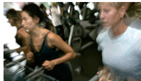
Women need how much exercise?