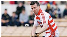
In a hyper-macho Irish sport, a coming out