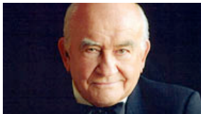
Ed Asner on the movie 'Up,' FDR and Elvis